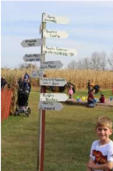
Buckhorn Pumpkin Fest 2017

We live in Ennismore and are starting to see Scarecrow displays throughout the area. It is a great display of community spirit.