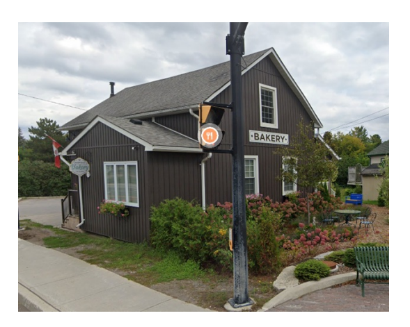
Photo of Lakefield Bakery (127 Queen Street, Lakefield) after exterior renovation work

Photo of Lakefield Bakery (127 Queen Street, Lakefield) before exterior renovation work