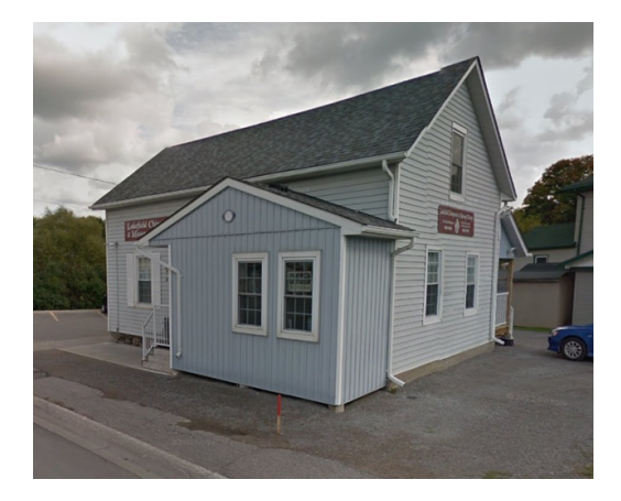
Photo of Lakefield Bakery (127 Queen Street, Lakefield) before exterior renovation work