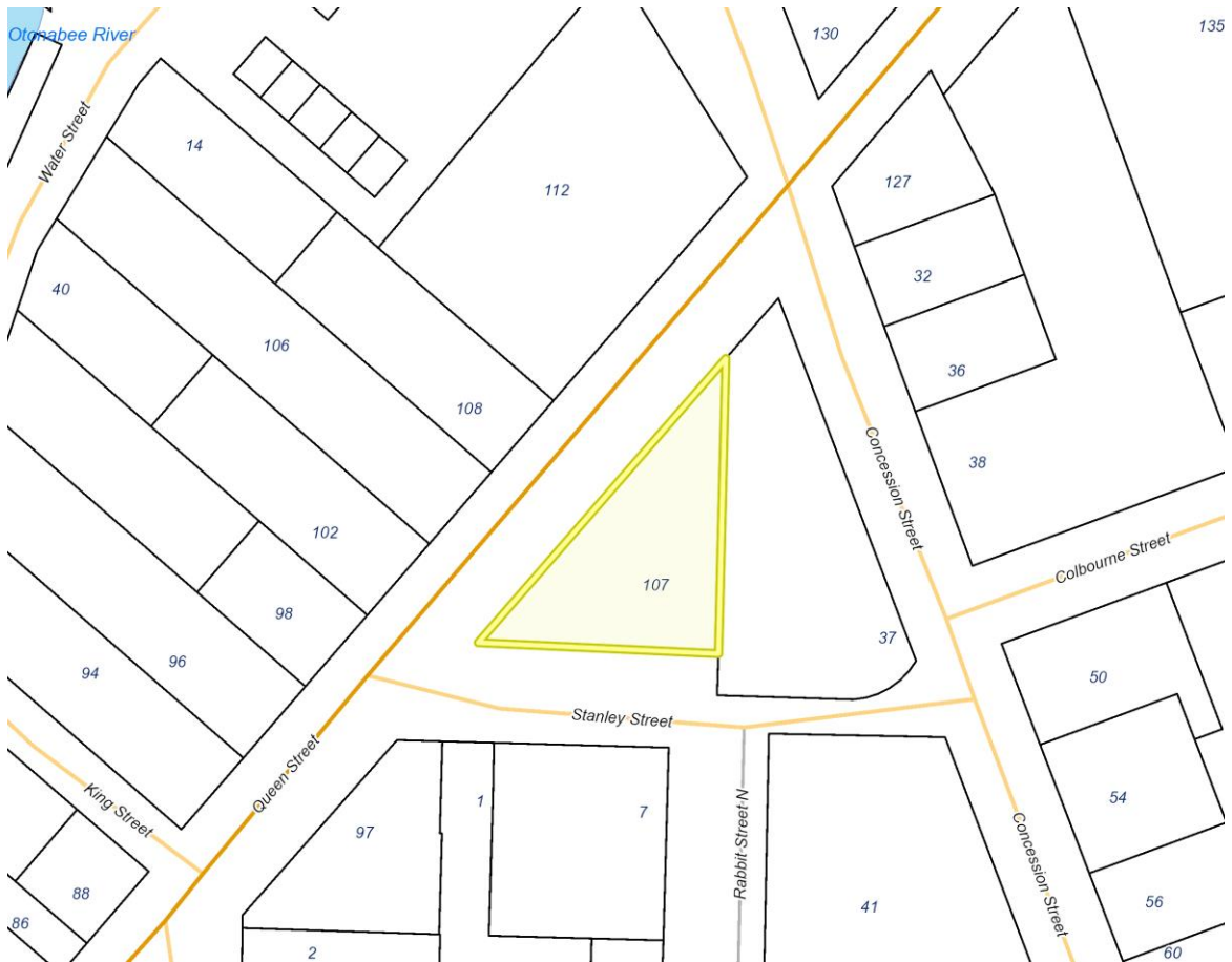
Key Map 107 Queen Street – Lakefield Ward