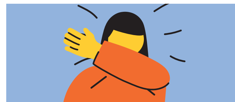
Cough into Your Sleeve