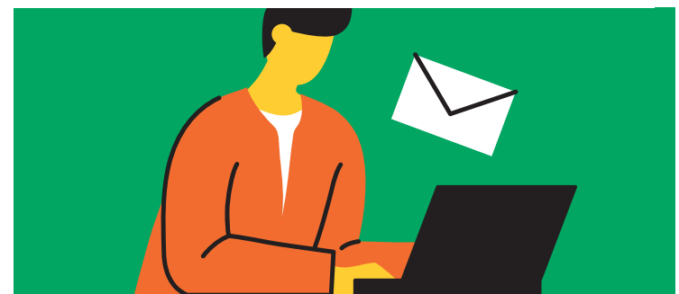
Self-Isolate for 14 Days After Travel