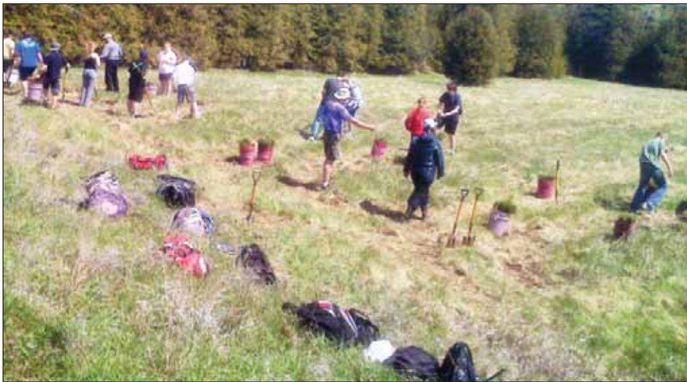
As in previous years, the Public Works Department teamed up with TASSS students to plant 1,000 trees at the Ennismore Pit site. Council would like to thank TASSS students for their continued efforts!

For more information on the Habitat for Humanity Lakefield project please visit www.habitatpeterborough.ca or call 705-750-1456