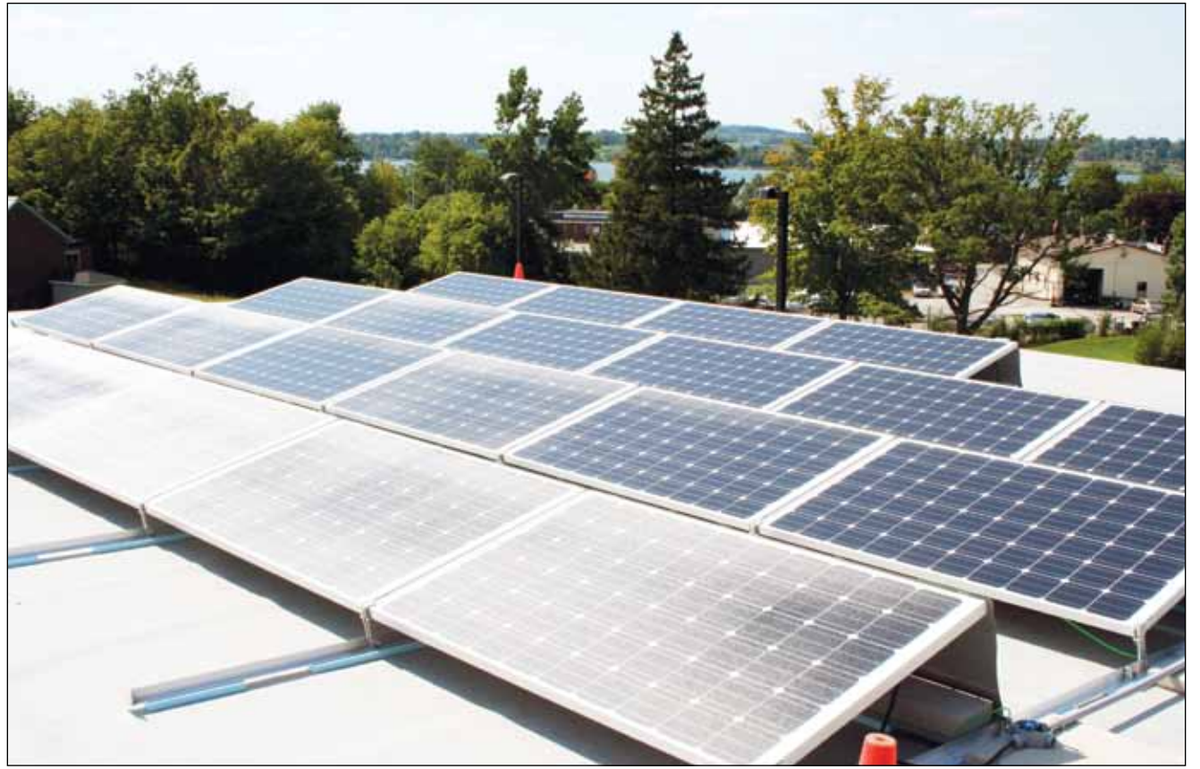
Solar Panels on the rooftop of the Bridgenorth Library.

As always, we appreciate your patience during the busy road construction season.