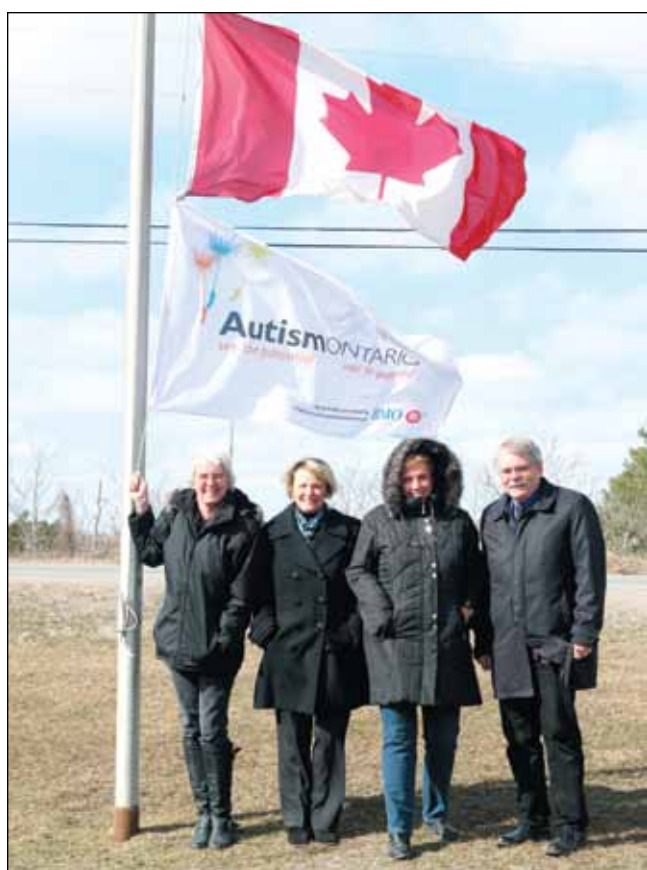
Council members raising the Autism Ontario flag to increase awareness on April 2, 2013.