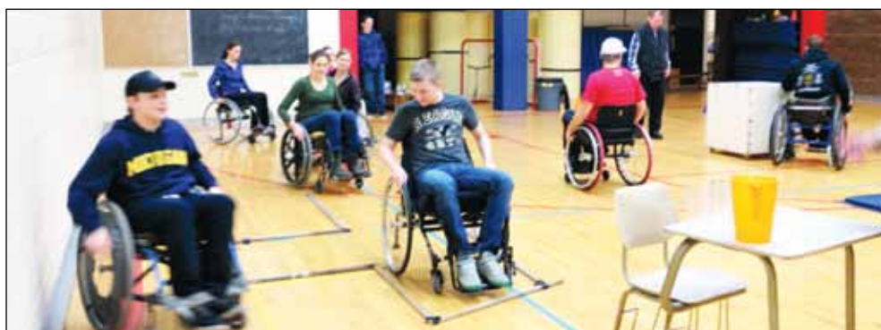
The Joint Township and Peterborough County Accessibility Advisory Committee held its annual "Time in my Shoes" event at Crestwood Secondary School. Students took part in activities such as wheelchair basketball, sledge hockey, and wheelchair obstacle course. The event raises awareness and identifies barriers to accessibility.