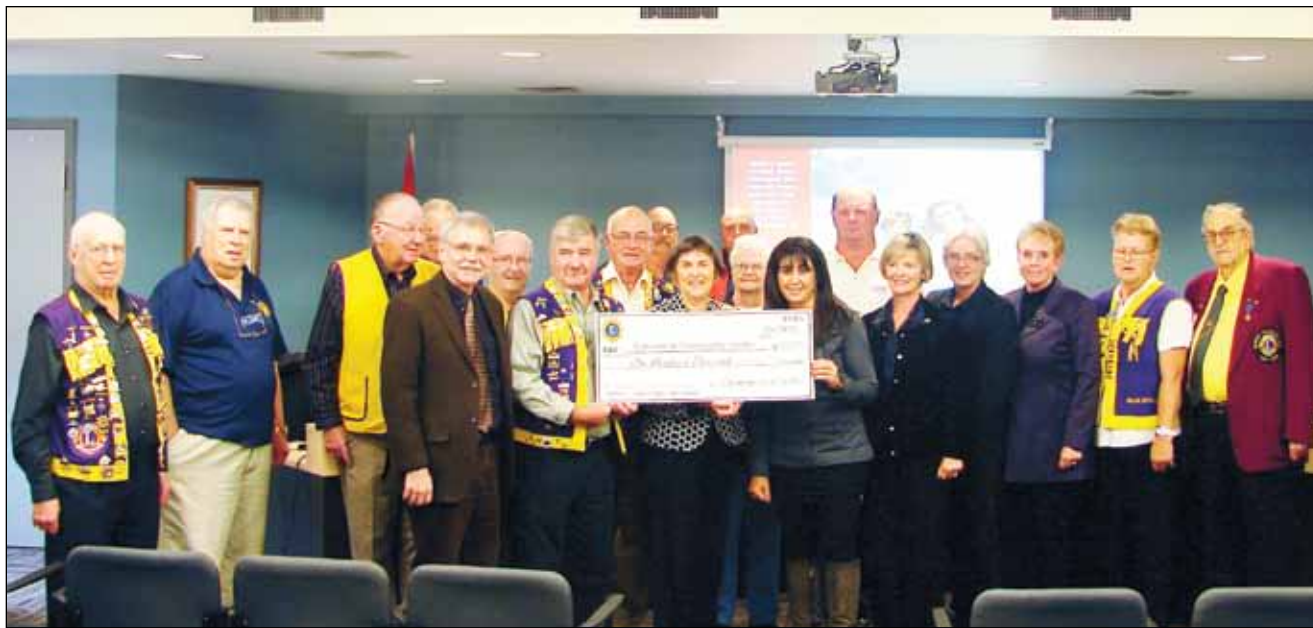
Chemung District Lions Club presents Council with a $100,000 donation for the Ennismore Community Centre.