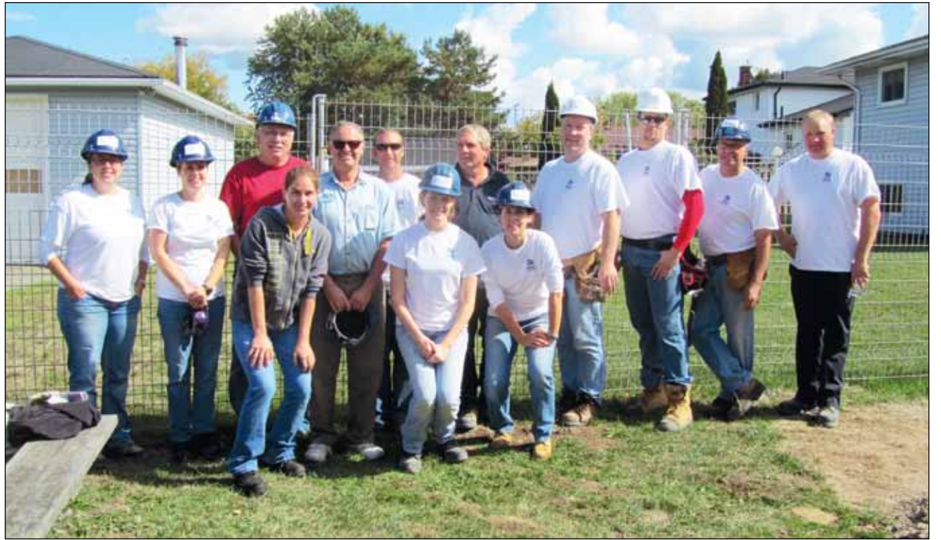
Township staff and community members at the Township Build Day in Lakefield.

If you're interested in volunteering, contact Habitat for Humanity Peterborough & District at www.habitatpeterborough.ca .